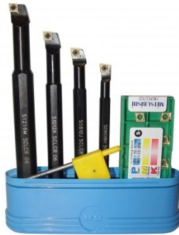
L072 HSS Turning Tool Set - 4 piece