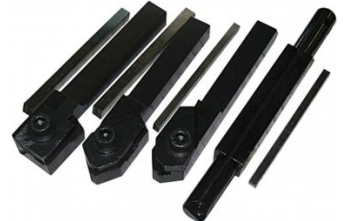
L0085 Carbide Turning Tool Set - 11 piece