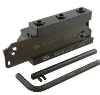
L466 Professional Lathe Parting Tool Kit - Insert Type