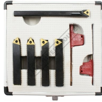
Set in Case