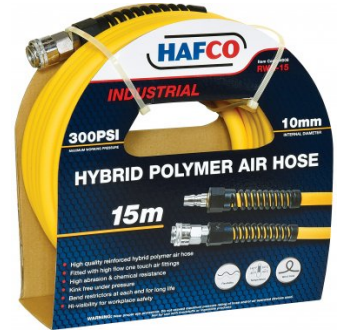
H008 Industrial Polymer Air Hose Reel