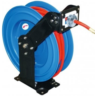
H040 Industrial Retractable Air Hose Reel