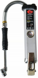
A264 Professional Tyre Inflator with Linear Gauge