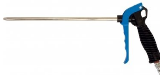
A251 Hi Flow Air Duster Gun