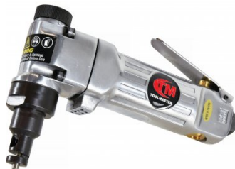
A082 Air Nibbler