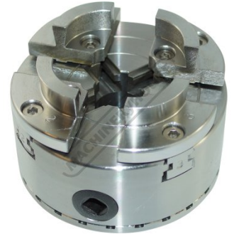
W370 WSC 100 Scroll Chuck