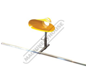
W290D Dust Chute with Adjustable Brackets 100mm