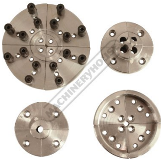
W375 WSC KIT Scroll Chuck Accessory Kit