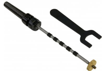
W306 Pen Mandrel Set - 2MT