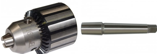
D442A 2MT x JT3 Drill Chuck Arbor