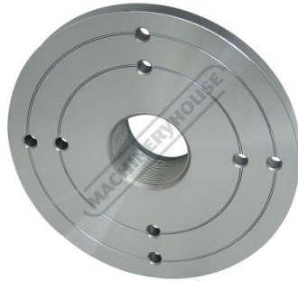
W298 FP 150 Face Plate 150mm