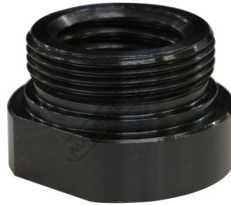
W366 Scroll Chuck Insert M30x3.5mm