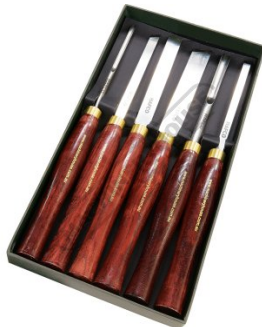
W3036 CHS6P HSS Turning Tool Set