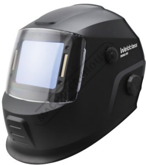
PROMAX 650 Auto Darkening Welding Helmet