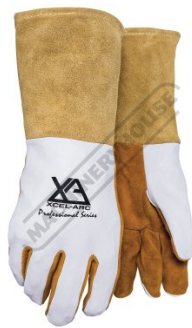
UMWG3 TIG Welding Gloves 310mm