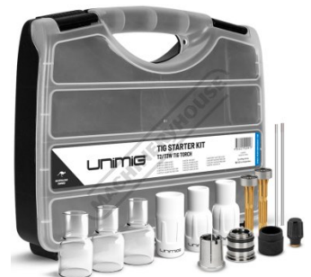
UMSKT2 T2 Tig Torch Consumable Pack