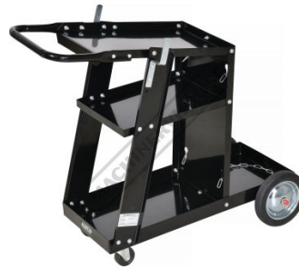
WTU 500 Universal Welder Trolley