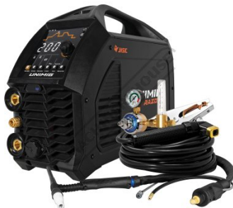
RAZOR TIG 200 ACDC WELDER