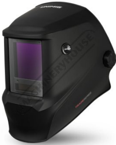
Series Welding Helmet Black