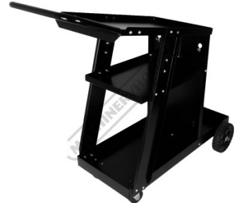
Small Machine Welding Trolley