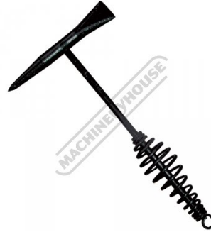
UMCH HD Chipping Hammer