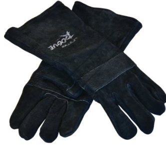
Professional Leather Welding Gloves