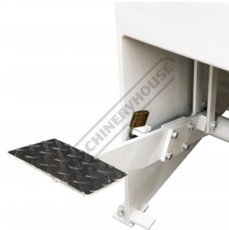
Foot Pedal Lever Shown Locked with Optional Padlock