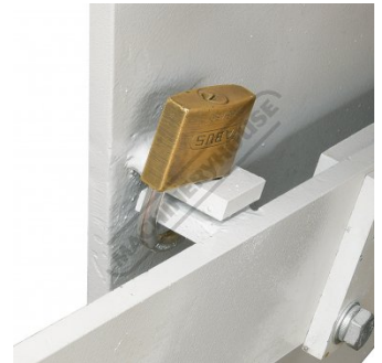
Isolation Tabs Shown Locked with Optional Padlock