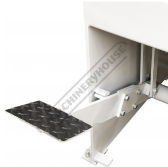
Foot Pedal Lever