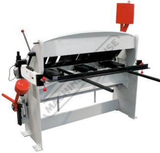
Rear Back Gauge