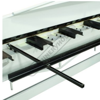
Rear Manual Backgauge