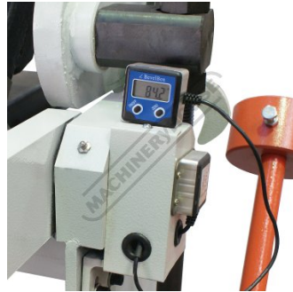
Digital Angle Readout