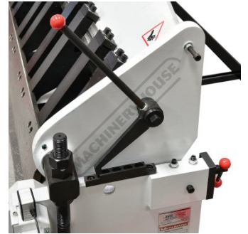
Top Beam Support Stop Lever and Thickness Adjustment Handle