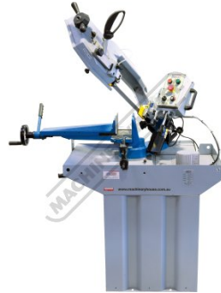
Swivel Head at 60 Degrees