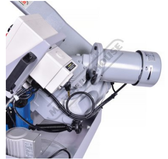
Variable Speed Motor and Gearbox