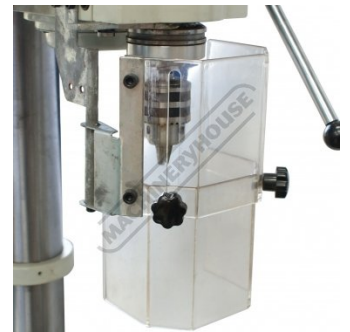
Interlocked Spindle Safety Guard