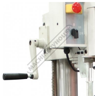
Rack and pinion wind up drill head