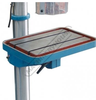
T Slotted Work Table Rotates 360 Degrees