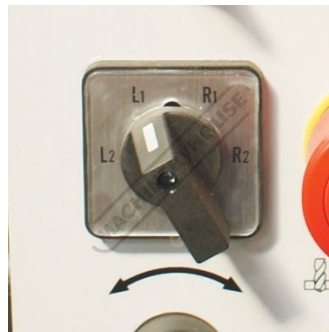
High Low with Forward and Reverse Switch