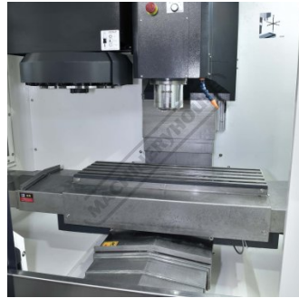
Front View Close Up