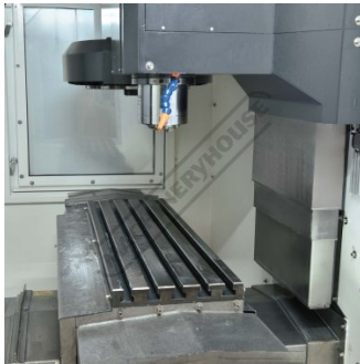
Bed Side View