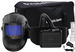
K84527 Welding Helmet with PAPR Respirator