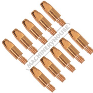
Contact Tips 0.9mm