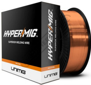
Mild Steel 5kg