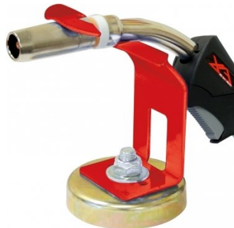
W10362 Magnetic MIG Torch Rest