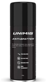
W119 Anti-Spatter Spray