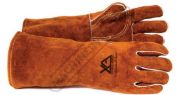
Professional Leather Welding Gloves