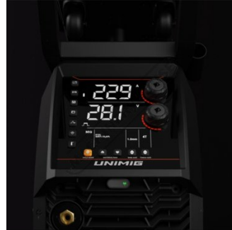
HD Backlit Interface