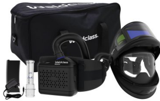
K84528 Welding Helmet with PAPR Respirator - Flip-up Lens