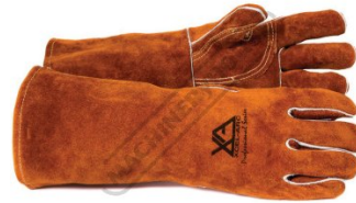
Professional Leather Welding Gloves