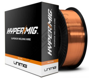
Mild Steel 5kg