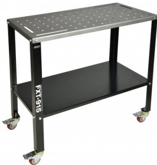
W08450 FIXTURE TABLE