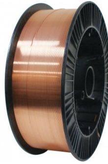
W136 Ø0.8mm Mild Steel MIG Welding Wire