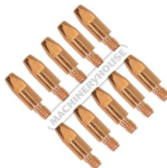
Contact Tips 0.8mm