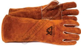
Professional Leather Welding Gloves