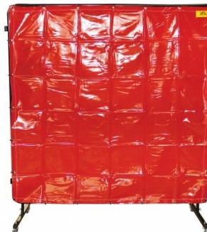
W225 Welding Curtain