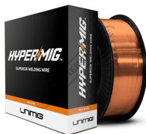
Mild Steel 5kg