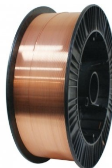
W136 Ø0.8mm Mild Steel MIG Welding Wire