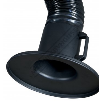
Fume Extraction Head