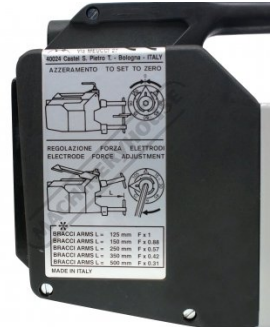
Force Adjustment Chart