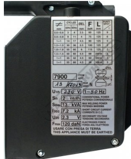
Specification Chart Weld Capacity