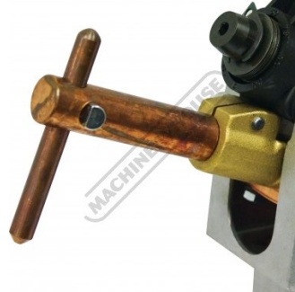
Top Electrode Holder