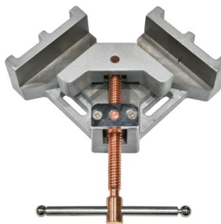
V099 90 degree Angle Vice Clamp