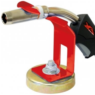
W10362 Magnetic MIG Torch Rest