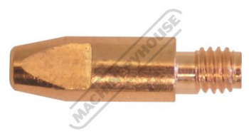
Pkt 10 Tips PCT0009 08