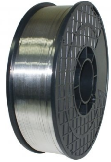
W144 Ø1.2mm Aluminium MIG Welding Wire