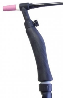
W171D Air Cooled TIG Welding Torch