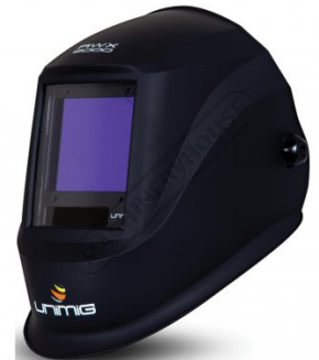
UMRWXWH Auto Welding Helmet