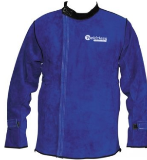
W1002A Professional Promax BL7 Welding Jacket