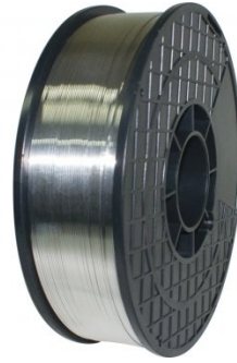
W143 Ø1.0mm Aluminium MIG Welding Wire