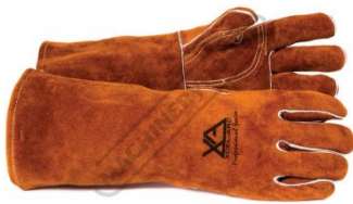
UMWG1L Professional Leather Welding Gloves