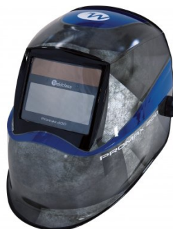
W001 Auto Darken Welding Helmet - 9-13 Shade