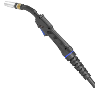
W563 MIG Torch - 3 Metre