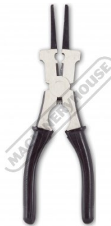
UMMP Mig Plier - Wire Cutter