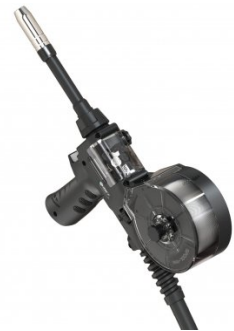
W181C Spool Gun - Light Duty