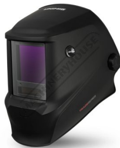
Trade Series Welding Helmet