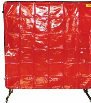
W225 Welding Curtain