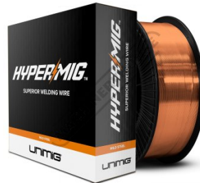
Mild Steel 5kg