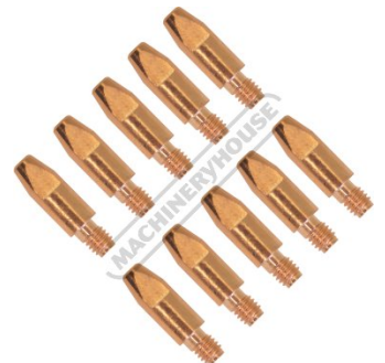
PCT0009 08 10x0.8mm Contact Tips