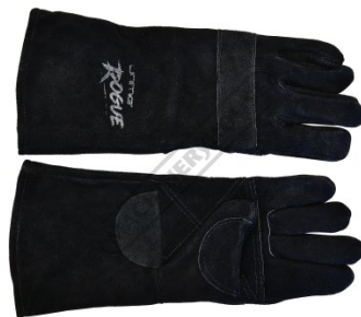
Leather Welding MIG Gloves