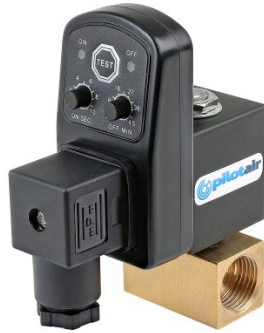
A195 Industrial Automatic Compressed Air Condensate Drain