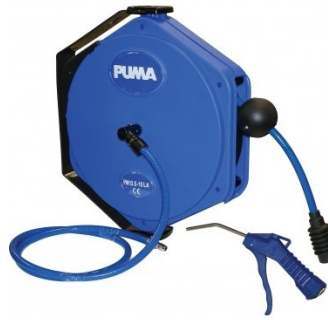
H045 Retractable Air Hose Reel - Includes Air Dusting gun