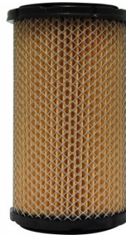
C3491A Filter Assembly