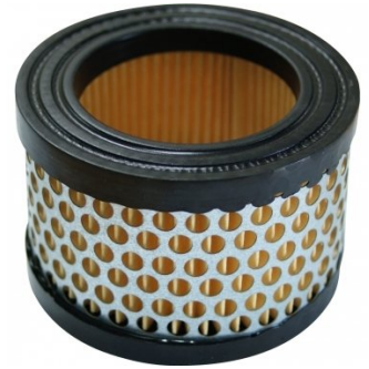
C349A Filter Assembly