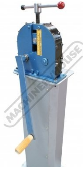
Optional stand also available (K8321)