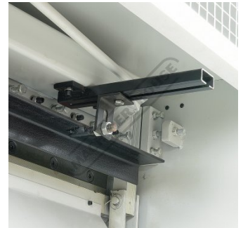
Backgauge Close Up