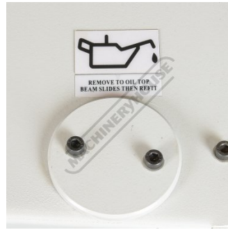
Oil Refil Points