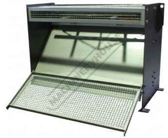
Lockable Hinged Rear Guard