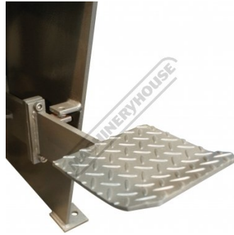
Foot Lever Unlocked