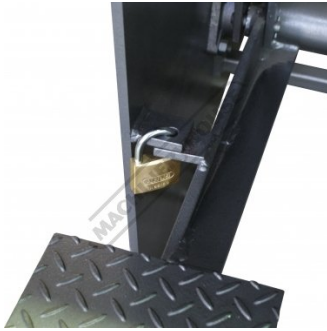
Safety Lock on Foot Lever