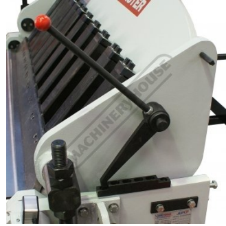
Top Beam Support Stop Lever