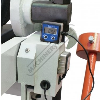
Digital Angle Readout