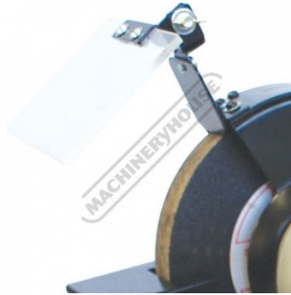
Adjustable Eye Shields