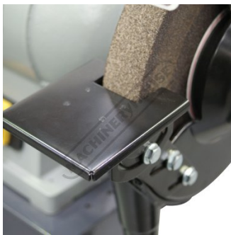
Adjustable Angle Tool Rests