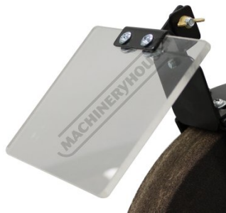
Adjustable Eye Shields