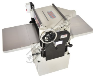
Cast Iron Feed Tables