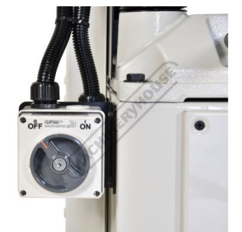
Key lockable switch