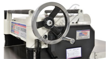
Height adjustment handle