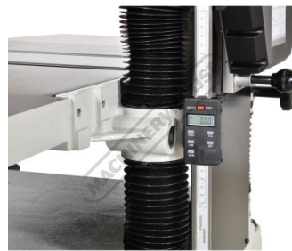
Digital height readout