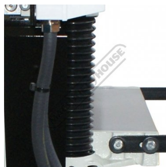
Protective Concertina Covers