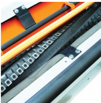
4 x Spiral Cutter Head with Carbide Inserts