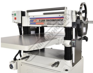
Robust 4 post design