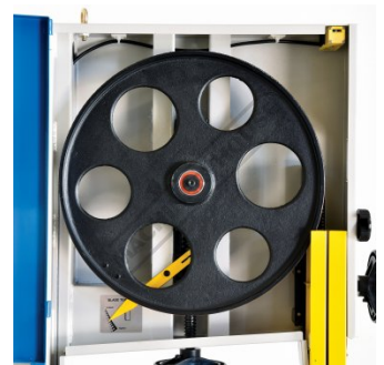
Cast Iron Blade Wheels