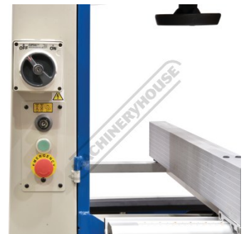
Keyed Safety Switch