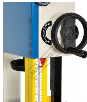
Rack Pinion Adjustment On Top Blade Guide