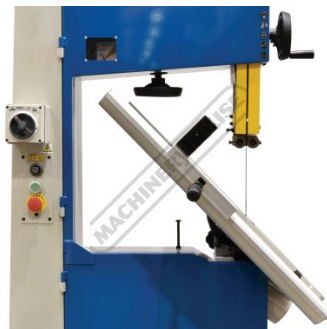
Cast Iron Table Tilts To 45 Degrees