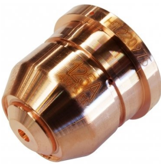
P850 Hypertherm 125A Nozzle