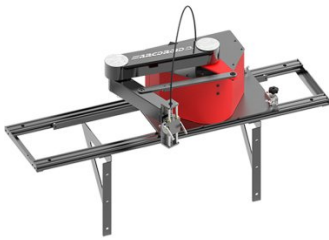
P8994 X2 Large cut indexing system