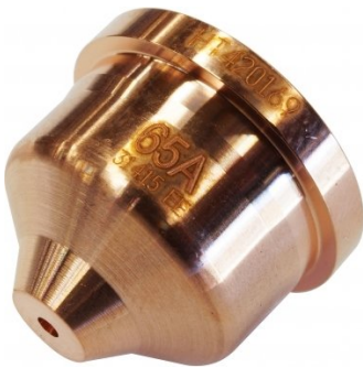
P851 Hypertherm 65A Nozzle