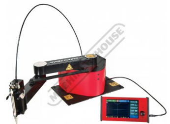
Setup With Trace Pen