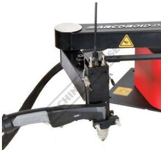
Plasma Torch Cradle