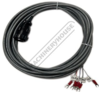
Universal CNC Cable