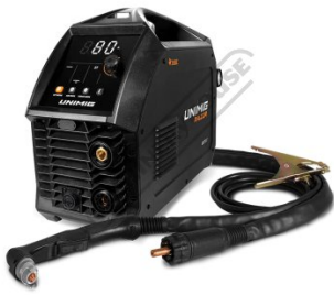
Shown with Included Accessories