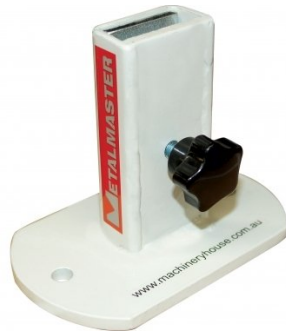
S2239 Dolly Stand Holder