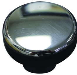
B8967 Doming Bottom Die