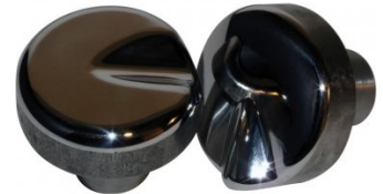
B9054 2" Thumbnail Shrink Die Set