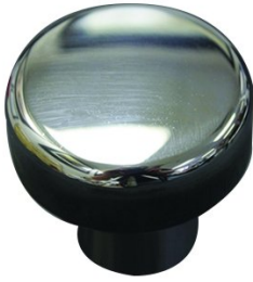
B8968 Doming Bottom Die