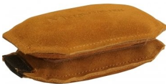
S214 Rectangle Leather Bag - Steel Shot Filled