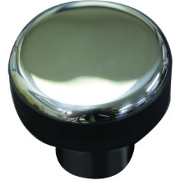
B8969 Doming Bottom Die