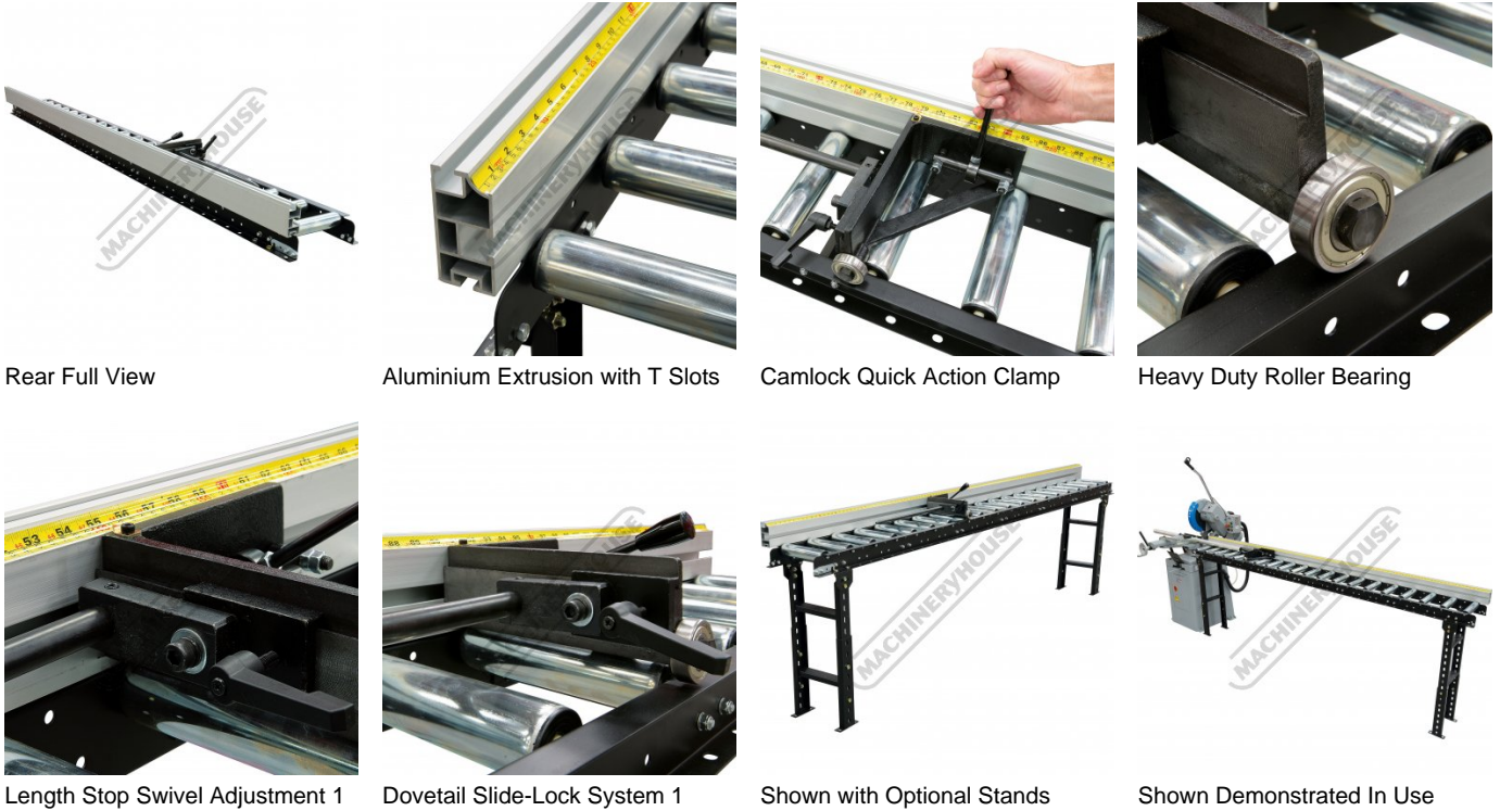
Rear Full View