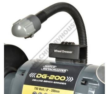
Wheel Dresser Work Light