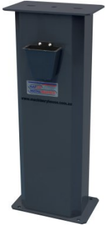
G189 0.5CT Grinding Wheel Dresser - Industrial Diamond Type