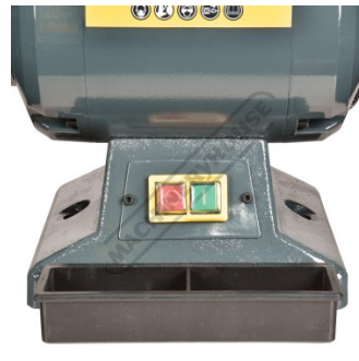
On Off Switch Cooling Tray