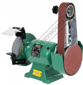
Linisher Shown Vertical