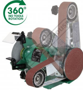
360 Rotating Linisher Attachment