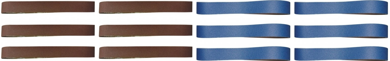
A8011 80G Zirconia Linishing Belt Pack