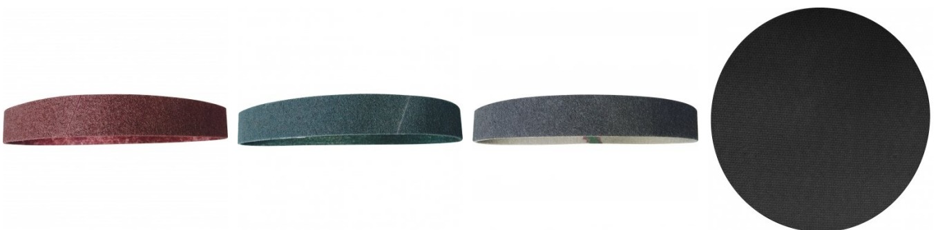
A0700 178mm (7") Hook & Loop Backing Disc