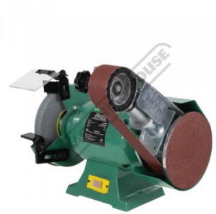
Linisher Shown 45