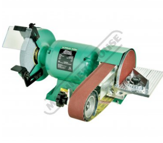
Table Flat Position