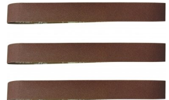
A8000 40G Aluminium Oxide Linishing Belt Pack