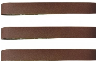
A8001 60G Aluminium Oxide Linishing Belt Pack