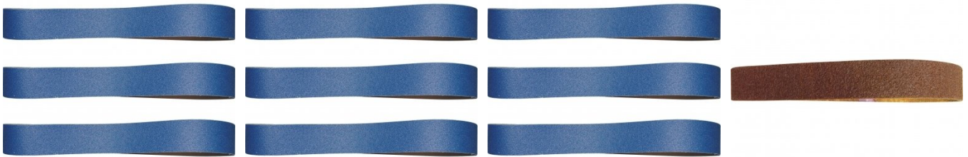
A36201 Scotch Belt Linishing Belt - Medium Red