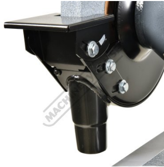
Dust Chute Adjustable Tool Rest