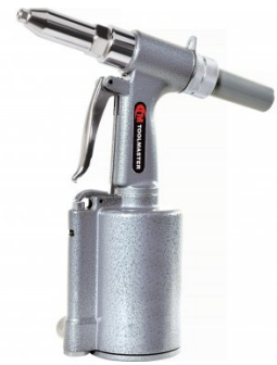
A046 Air Pop Rivet Kit