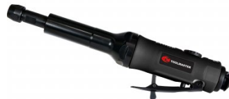
A041 Air Die Grinder - Extended Shaft 5" (127mm)