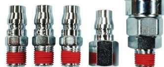
F935 High-Flow Air Fittings