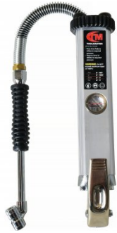
A264 Professional Tyre Inflator with Linear Gauge