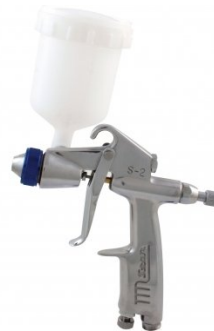
S322 Gravity Feed - Spray Gun