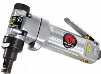
A082 Air Nibbler