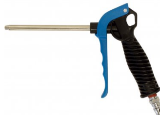
A250 Hi Flow Air Duster Gun