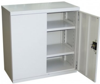
T774 Industrial Storage Cabinet