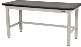
A420 Industrial Work Bench