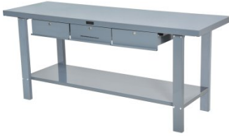
A380 Steel Work Bench - 3 x Lockable Drawers