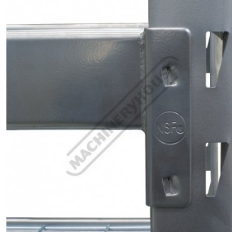
External Shelf Locking System