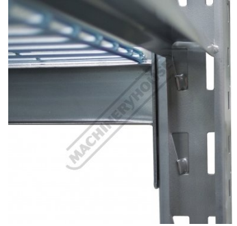
Internal Shelf Locking Wedge Type System