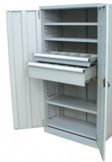
T762 Industrial Storage Cupboard