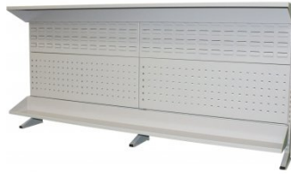
A426 Industrial Backing Panel - Bench Mount