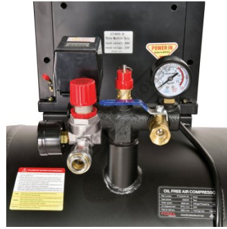
Pressure Gauge & System Valve