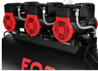
Triple 1.5hp Motors