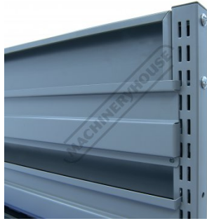
Optional Bracket Securely Clipped Onto Frame