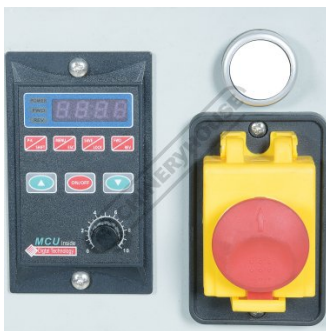
Speed Control and On Off Safety Switch