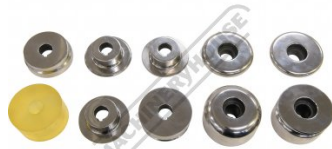
MBR-10K - Forming Bead Roller Kit