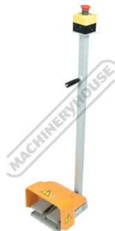
Forward and Reverse Foot Control With Emergency Stop Switch