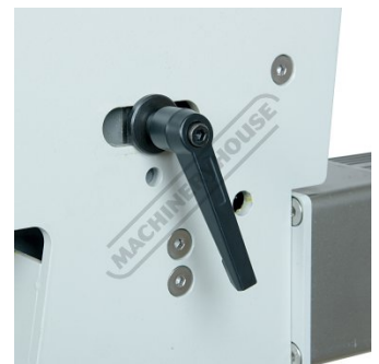
Locking Levers For Top Shaft Die Alignment