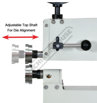
Adjustable Top Roller