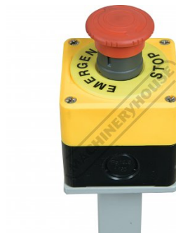
Emergency Stop Close Up