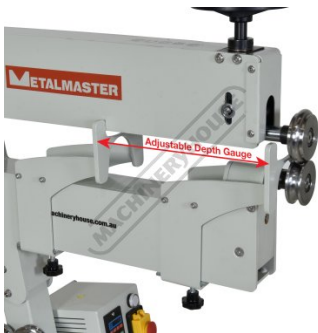
Adjustable Depth Gauge