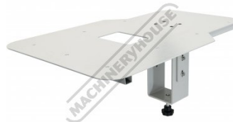
MBR-FWT - Steel Support Work Table