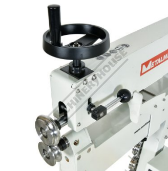
Upper Mandrel Adjustment Handle