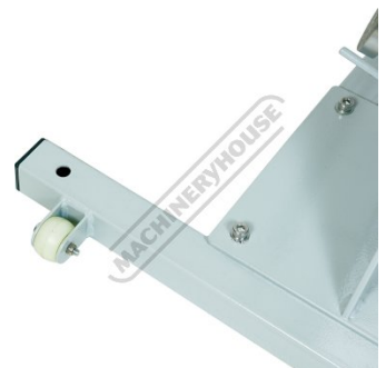
2 x Rear Wheels For Mobility