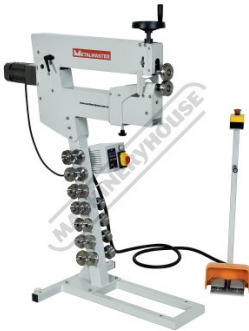
MBR-610XT - Bead Roller