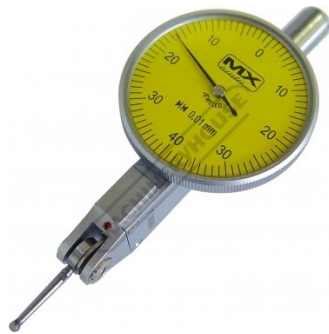
Dial Test Indicator