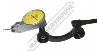
Shown holding optional indicator