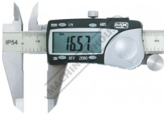
Front Close Up