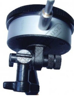
Shown holding optional Dial Indicator