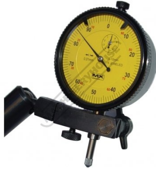
Shown holding optional Dial Indicator