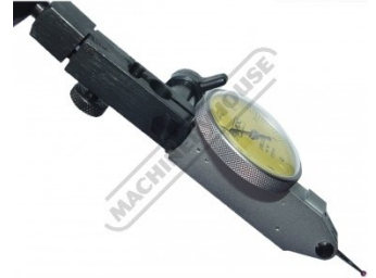
Shown holding optional Dial Indicator