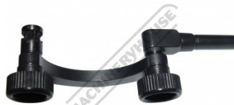
Dial Indicator Holder