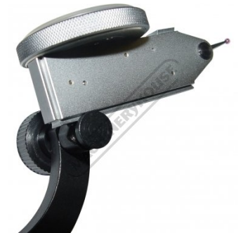
Shown holding optional indicator with Dovetail Slide clamp