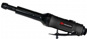
A041 Air Die Grinder - Extended Shaft 5" (127mm)