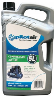
C346 ISO 150 Air Compressor Oil