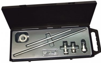
C660 Plasma Circle Cutting Kit