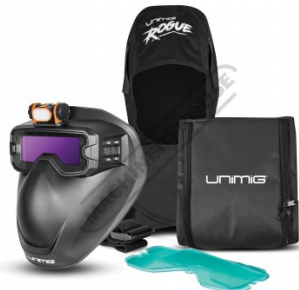
Auto Darken Welding Goggle & Mask - 5-9/9-13 Shade