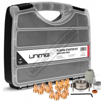
SC80 Plasma Torch Consumable Starter Kit