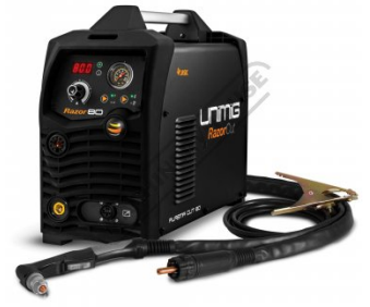
Razor Cut 80 Kit