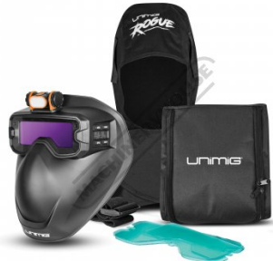
Auto Darken Welding Goggle & Mask - 5-9/9-13 Shade