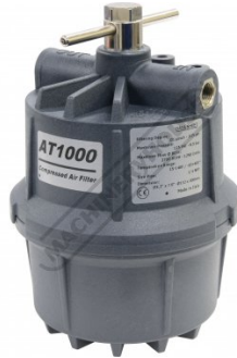
Plasma Sub-Micronic Air Filter Canister