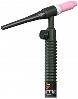
W170 Air Cooled TIG Welding Torch