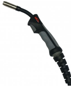
W542A MIG Torch - 3 Metre