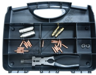
Case Top View