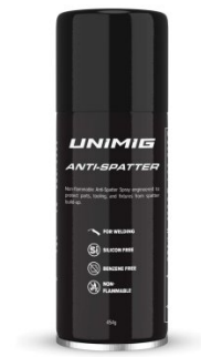
W119 Anti-Spatter Spray