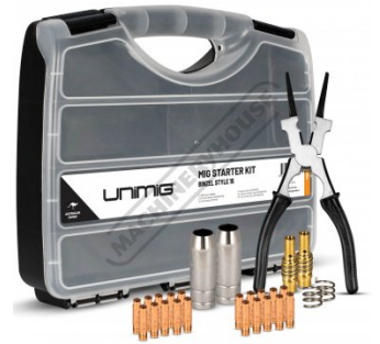
UMSK15 - SB15 Mig Torch Consumable Pack