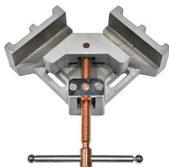
V099 90 degree Angle Vice Clamp