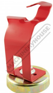
MIG Torch Holder