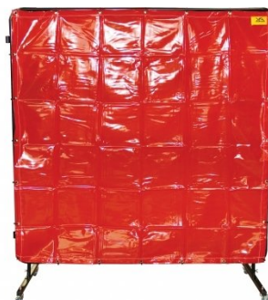
W225 Welding Curtain