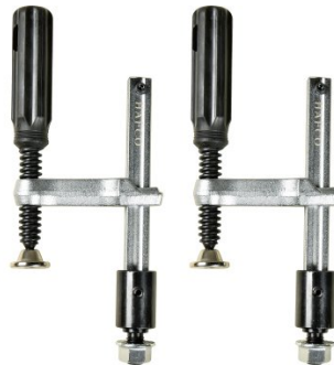
W08510 Weld Clamps with Locking Nuts (2 Piece Pack)