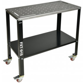
W08450 FIXTURE TABLE