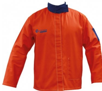
W1000A Promax HV5 Welding Jacket