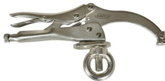
C103 228mm Multi-Purpose Locking Clamp