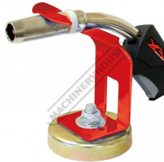
Holder Shown with MIG Torch