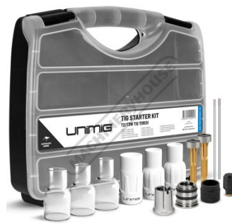
Tig Torch Consumable Pack