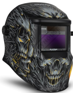
Revenant Welding Helmet