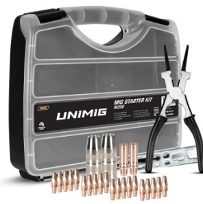
W501A M350 MIG Torch Consumables Starter Kit