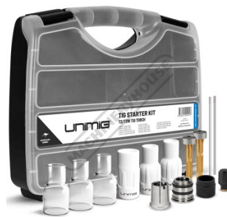
Tig Torch Consumable Pack