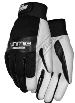
ROGUE™ TIG Welding Gloves