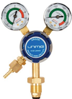
W160A Argon Gas Regulator-Twin Gauge