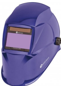
W002 Auto Darken Welding Helmet - 9-13 Shade