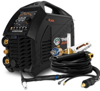
Complete Machine Kit