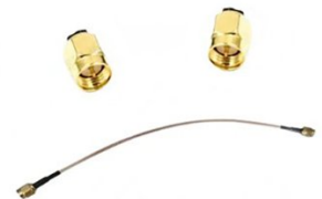
AL3011 Radio Frequency Cable