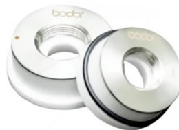
AL3010 Ceramic Ring