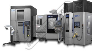
Auto Work Changer