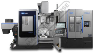
DVF 5000 AWC