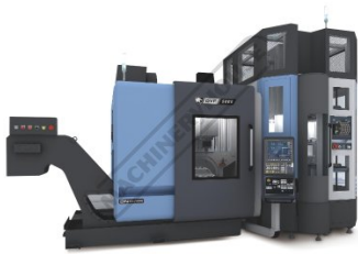
DVF 5000 AWC