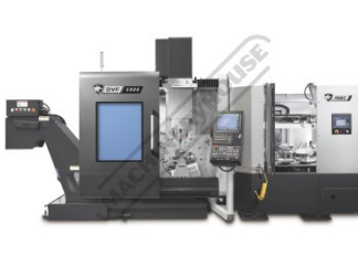
DVF 5000 12AWC